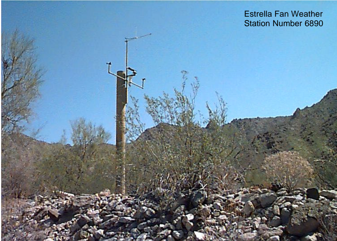
Estrella Fan Weather Station Number 6890

FCDMC Annual Hydrologic Data Report Volume III: Weather Statistics Water Year 1999